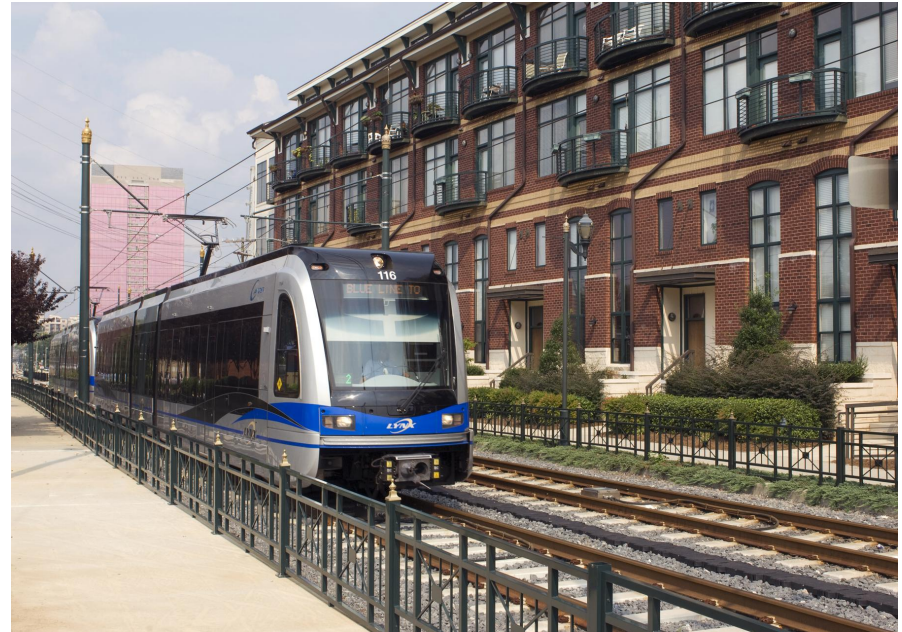
Charlotte Area Transit System

Impact of a project on the transportation system