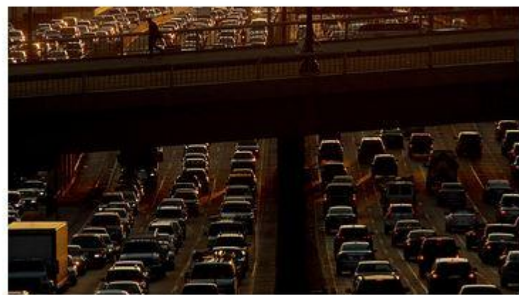
Traffic jams the harbor Freeway. Under the previous CEQA process, a development project is deemed to have a negative environmental impact if it would slow traffic.

By THE TIMES EDITORIAL BOARD contact the reporter